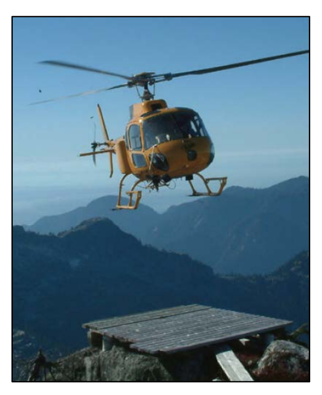
Figure 1. An Airbus AS 350 conducting a pinnacle approach in remote mountainous terrain.

The Airbus AS 350 series is a popular helicopter (also known as an "AStar" or a "Squirrel") that is used throughout Alaska for a variety of missions involving carrying passengers. Some of these missions include commercial operations (aerial photography, glacier treks, heli-mushing, heli-skiing/snowboarding, construction, etc.), public use, and natural resource industry support (oil, gas, mining, forestry, etc.).